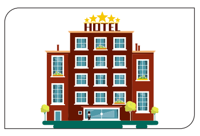
Hotel / Guesthouse Bookings