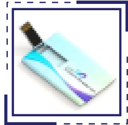
Customized Pen Drive