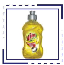
Vim Dish Wash