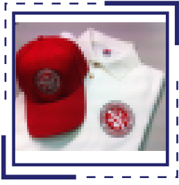
T-Shirt & Cap Printing